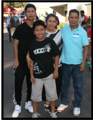
Thank you all who contributed to the memorial fund.